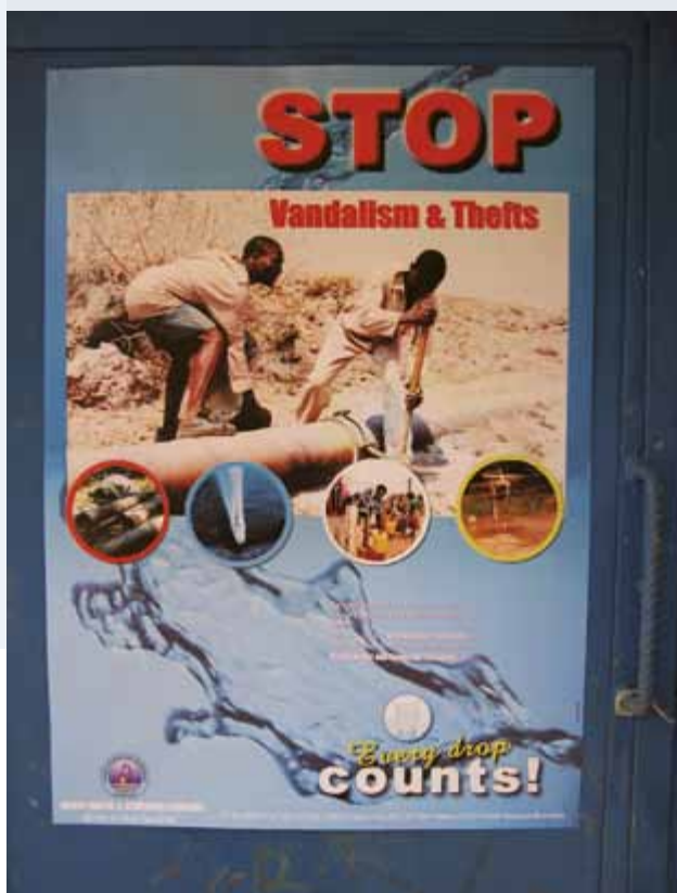
Water provider warns against vandalism and theft, Zambia

Establishing cooperative water management institutions such as water user associations or river basin organisations, and building their capacities and providing institutional, financial, and technical support.