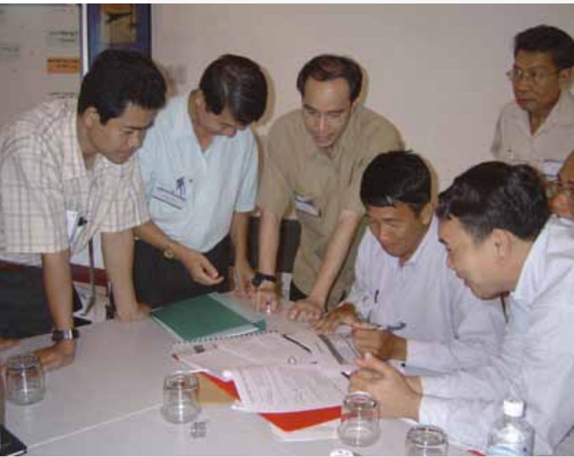
Mekong: Discussion between experts