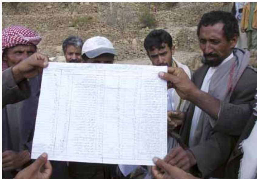
List of recorded and agreed daily water entitlements of each family, Amran Governorate, Yemen

When discussing water conflict, three major factors must be considered. Quantity of water—both in abundance and deficit—can play a role. For example, parties may struggle to adapt to increased frequency and intensity of droughts or floods. Water quality is also a chief concern, as decreasing quality can make water unusable for certain purposes and by some populations. Moreover, the timing of water flow—in the operation of dams, for example—is also a critical issue, as flow rates can significantly alter the lives and livelihoods of downstream populations. At the same time, water is a highly politicised issue, largely