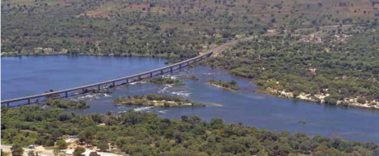
Bridge in the Southern African Development Community (SADC)