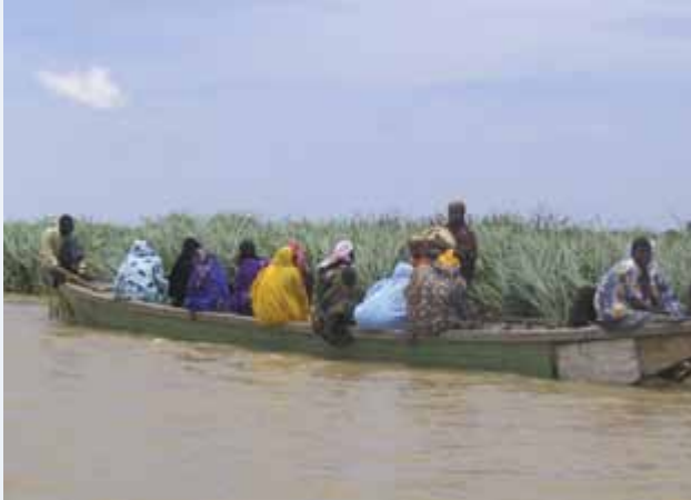
Passenger traffic, Lake Chad

by further politicising or securitising international water relations. Yet, linkages are also possible on issues within the water sector (Dombrowsky 2007).