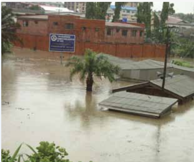
Flooded church compounds in Lagos, Nigeria

Climate change places additional pressure on livelihoods (see Box 2). The impacts of climate change will not be uniform; some regions will suffer from increased water scarcity, while others will be affected by floods, rising sea levels, and unpredictable precipitation. Migration of rural populations is expected to increase, especially where reduced food production affects already food-insecure areas. The potential for migration further increases in areas dominated by rain-fed agriculture, such as sub-Saharan Africa and peninsular India (IPCC 2008). While conflict potential over water is rising, hotspots cannot be identified on the basis of environmental trends alone. Vulnerability to conflict will depend crucially on each country's