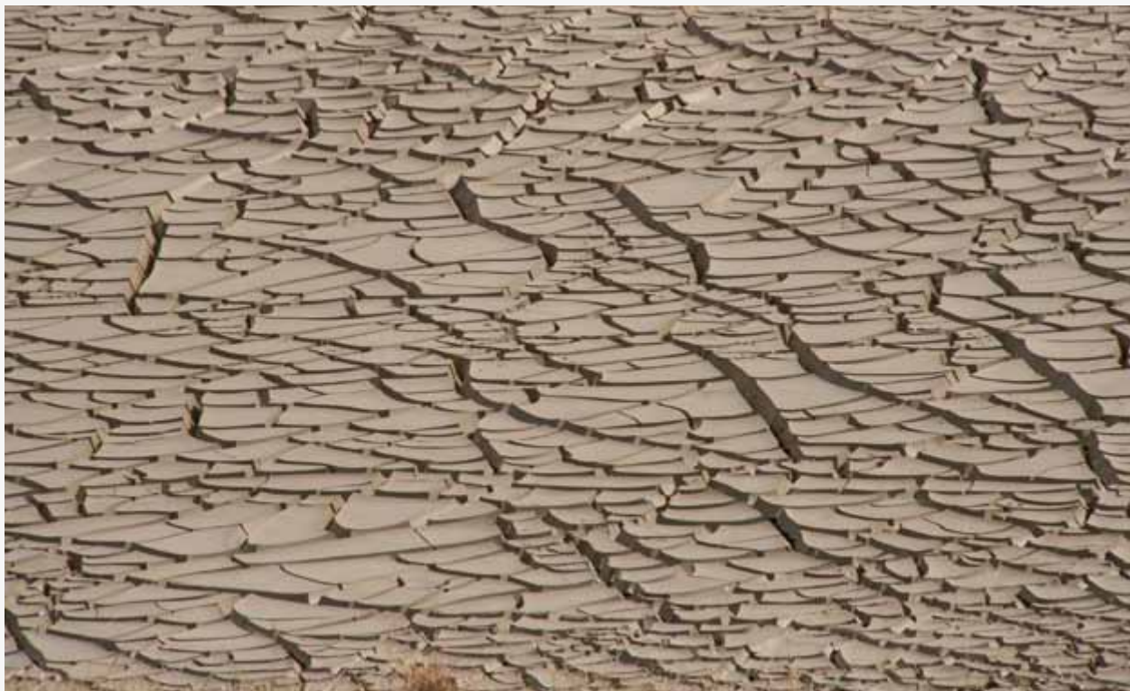
Heavy erosion, Botswana

Development cooperation in the water sector already contributes much to building the prerequisites for conflict prevention and management by development partners in the water sector. Yet, possibilities for exploring instruments and approaches more systematically could be thoroughly assessed. This would increase the opportunities of development cooperation to a more focussed and strategic approach to deal with the water security nexus, which will grow more important in the future.