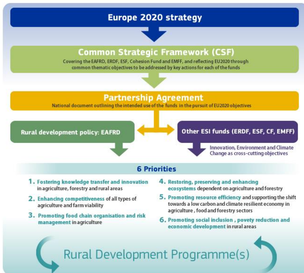
Figure 2. Priorities of the ESIF.